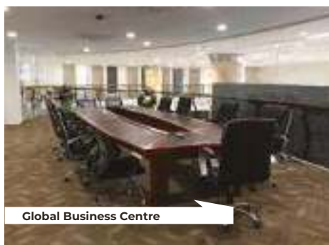
Global Business Centre